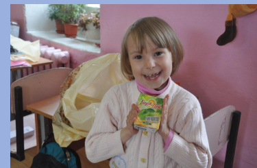
"I love this juice"