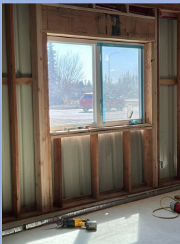
Windows for offices