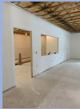
Kitchen & conference room