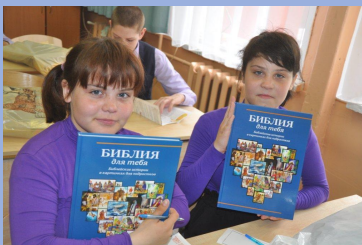
"I love my new Bible!"