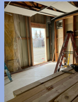
Side door for offices